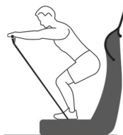
Squat w/Static Strap